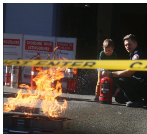
View Royal and Colwood fire departments are hosting open houses on June 10 and 11, respectively, with the public invited to come and meet their local firefighters and taken in fun activities and informative demonstrations.