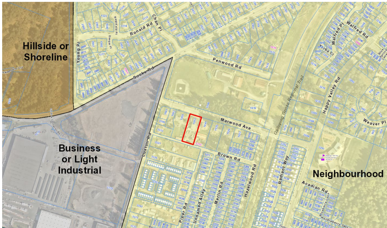
Figure 3: Surrounding OCP Designations

The applicant has indicated that they plan to pursue this use on a permanent basis. As the proposed use does not meet the objectives of the current OCP designation, any subsequent rezoning applications will have to be accompanied by an amendment to the Official Community Plan to Business or Light Industrial Centre designation. It is noteworthy to mention that the immediately adjacent properties are also within the Neighbourhood designation; however properties west of Luxton Road fall under Business or Light Industrial Centre designation.